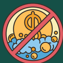
Anti-Money Laundering (AML)

It is the System of Self-Monitoring and Management of Integral Risk implemented by our company to prevent the risks of: