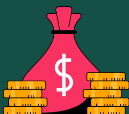
Financing of Terrorism (FT)