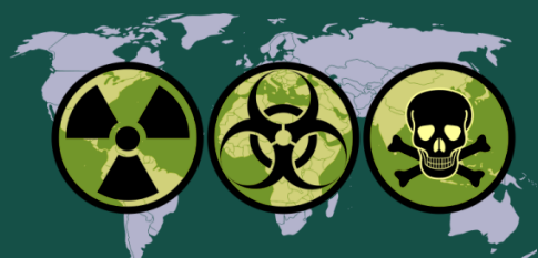
Financing of the Proliferation of Weapons of Mass Destruction (FPWMD)